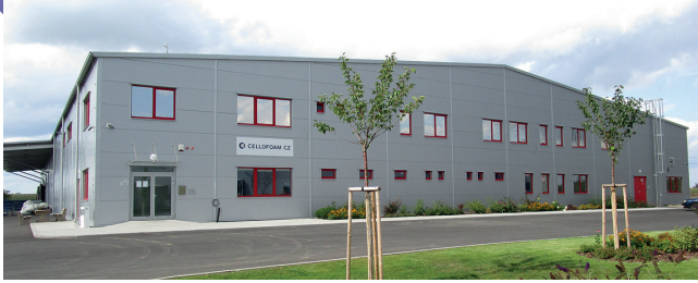
Our factory in Czech Republic