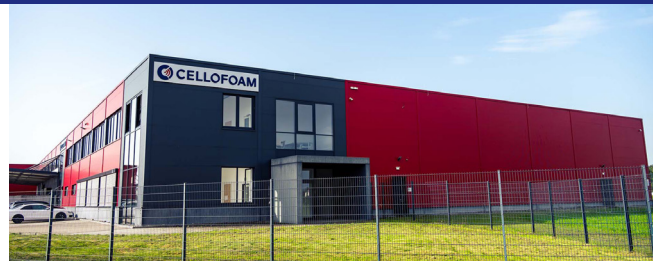
Our factory in Ochsenhausen

Cellofoam develops and produces high-quality sound insulation and sound damping products as well as sealing products for a wide range of industrial and technical uses.