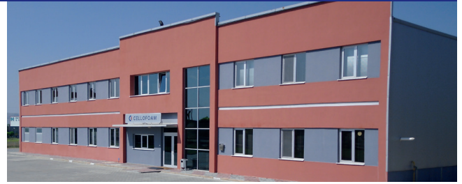
Our factory in Turkey