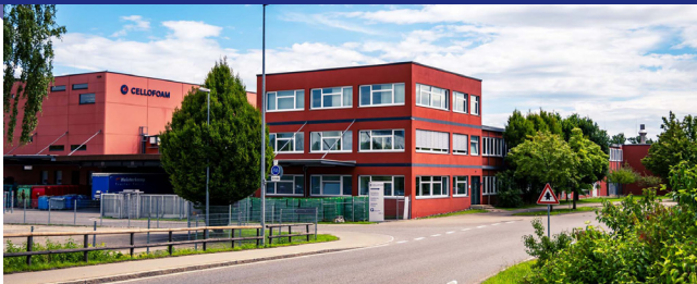
Our factory in Biberach